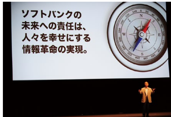
Announcement of SoftBank's Next 30-Year Vision (2010)

Sustainable development is imperative for businesses. Companies are expected not only to make short-term profits but also to create social value for stakeholders.