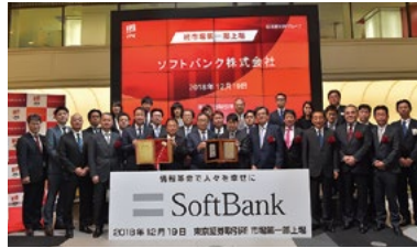
2018 SoftBank listed on the First Section of the Tokyo Stock Exchange