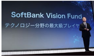
2017 Launched SVF1