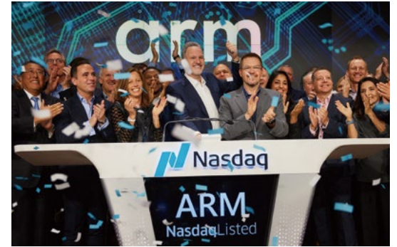
2023 Arm listed on the Nasdaq Global Select Market*